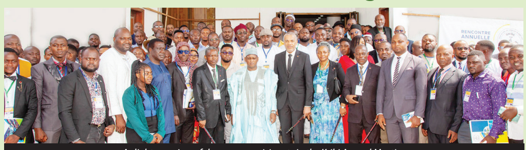
A slight overview of the many participants in the Kribi Annual Meeting

The annual meeting of Civil Engineers was held on January 26 and 27, 2024 in Kribi in the South region. Placed under the theme « Quality assurance and quality control in civil engineering », this event very frequented with more than 700 participants, has experienced several highlights including the recovery of technical days (the last having taken place in 2020), the graduation of several Engineers (to the ranks of Emeritus, Senior and Major), the swearing in of new Engineers and the Ordinary General Assembly.